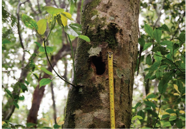
Figure 1. Nest of Blue-bellied Parrot Triclaria malachitacea in the trunk of a live Alchornea triplinervia tree, Serra Furada State Park, Santa Catarina, Brazil (Karoline Ceron)

This is the most detailed description of a wild nest of T. malachitacea to date 1 , as well as the first confirmed breeding evidence in Santa Catarina. In relation to previous data, our observations corroborate the known breeding period in southern Brazil (October–January) 1,3 , mean nest height above ground 1 and the results of Bencke 1 , who found that Alchornea triplinervia may be one of the most suitable nesting trees in southern Brazil. Clutch